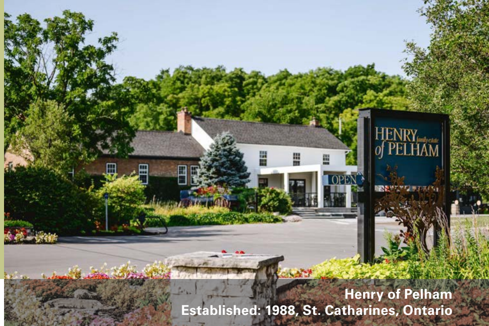
Henry of Pelham Established: 1988, St. Catharines, Ontario